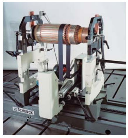
Underslung belt drive (BU)

Selection of a drive system is determined by the shape or your rotors. Combinations of different drive systems on one machine are possible. Underslung belt drives (BU) provide