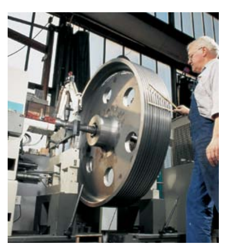
Universal-joint drive (U)

Selection of a drive system is determined by the shape or your rotors. Combinations of different drive systems on one machine are possible. Underslung belt drives (BU) provide