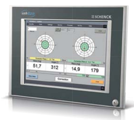
Measuring unit CAB 820

The choice of protective enclosure is determined by the danger the rotor presents, with due consideration to balancing speed, method of unbalance correction and maximum penetration energy of rotor components or fragments.