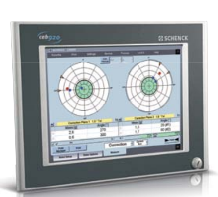
Measuring unit CAB 920

This measuring unit is always the right solution when you want to achieve the balancing objective in your business quickly and without major effort.