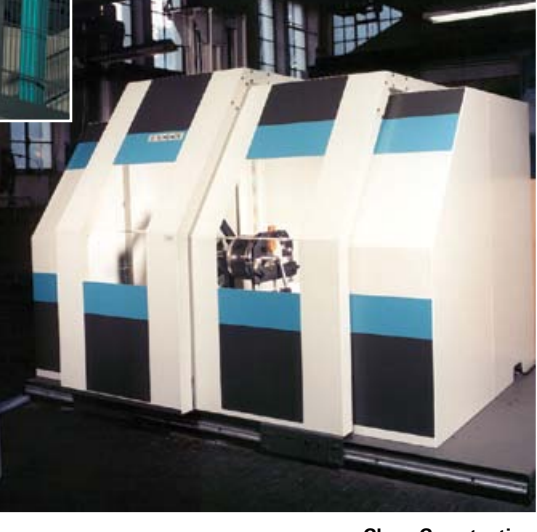
Class C protection